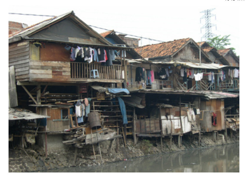
Figure 2. Residential condition of the urban poor

Participatory planning and budgeting potentially give the poor and vulnerable an access to the development process. However, to realize this, it is necessary to strengthen the participation of