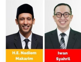
H.E. Nadiem Makarim