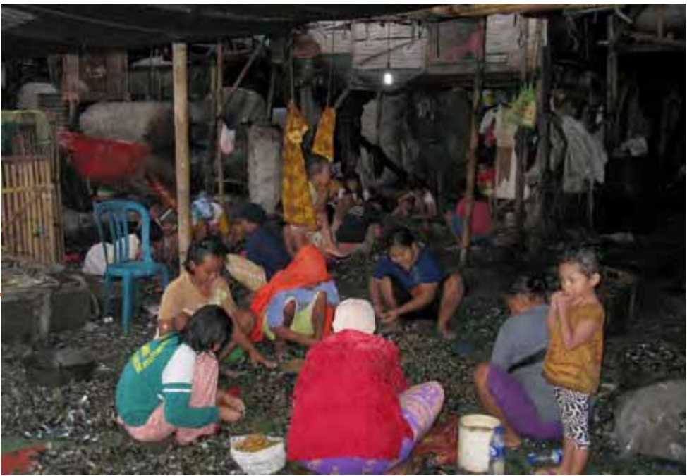
In North Jakarta, particularly in coastal areas, many children work in the fish market or peel shrimps and clams with their parents.

Furthermore, the usage of the term "poor" in social protection programs for poor households need to be reconsidered. If children tend to avoid the label "poor" as found in this study, then the usage of the term in social protection programs may bring bad influence for children's perception towards themselves.