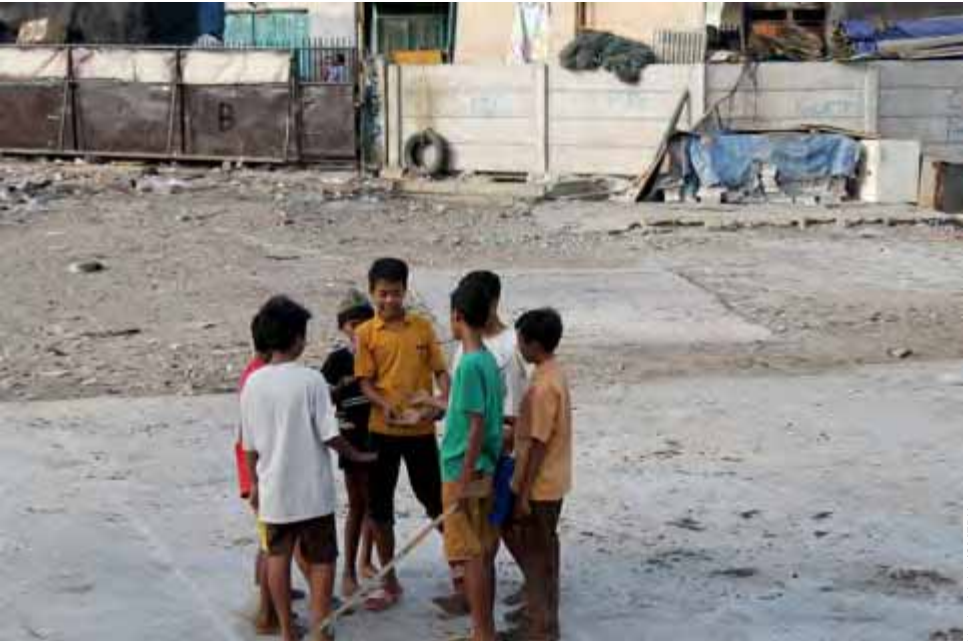
School enrollment deprivation rate of children aged 12-14 years is around 5%, while the rate of children aged 15-17 years is 26%.

This study also highlights the overlap between the government programs in reducing poverty on one hand and monetary as well as multidimensional deprivation condition on the other hand. The program analyzed in this study is the subsidized rice (Raskin) program which was launched in 1998 to improve food security and social safety net for targeted households. In relation to